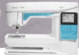
HUSQVARNA VIKING® OPAL™ 690Q