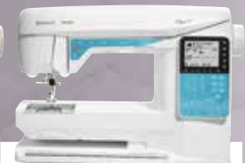
HUSQVARNA VIKING® OPAL™ 690Q